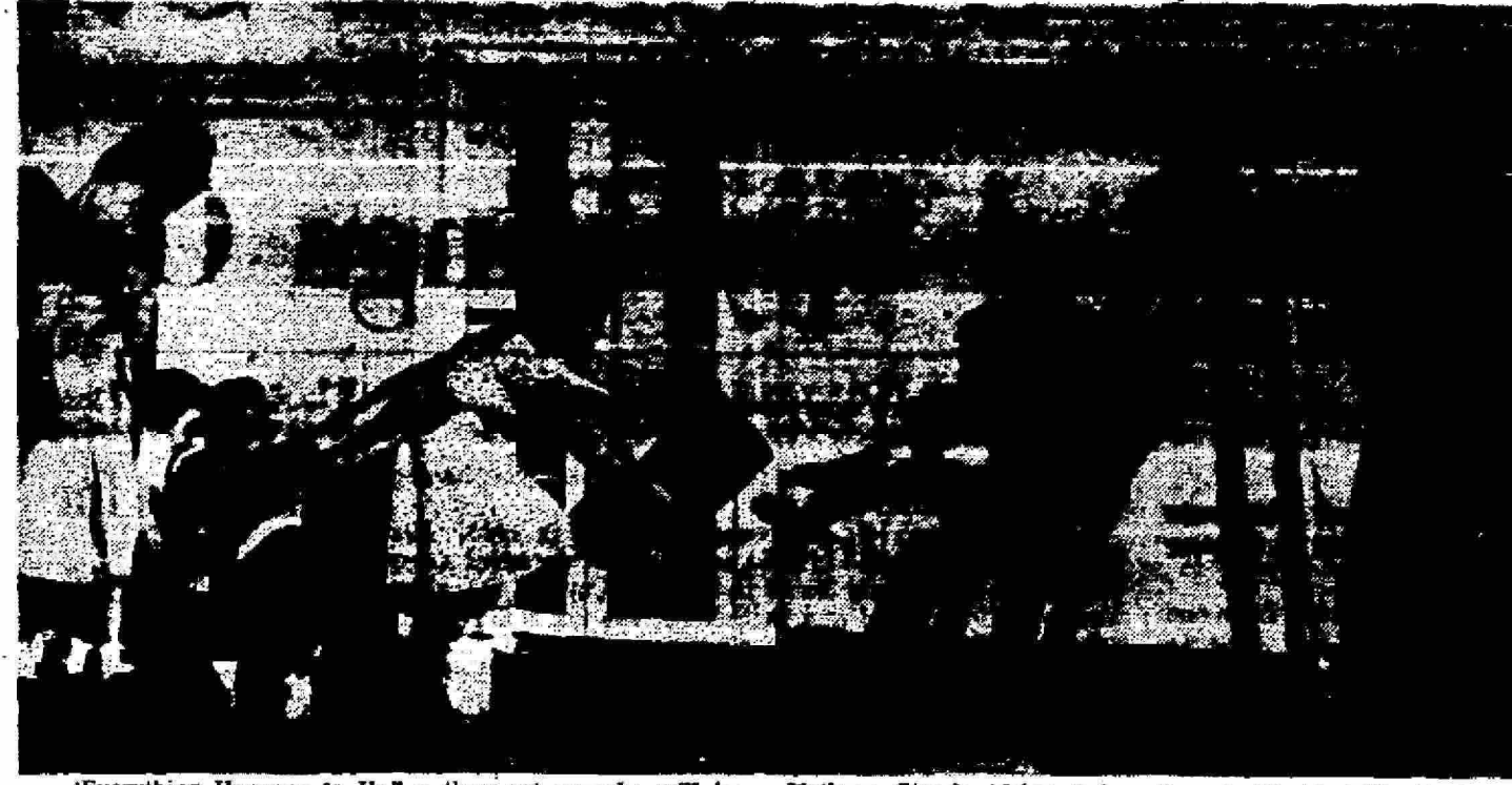
"Everything Happens to Us," a three-act comedy, will be presented by the senior class of Kellogg Central School, Treadwell, at 8 Friday night as a benefit to raise funds for the Easter trip. Featured in this bit of action are left to right,